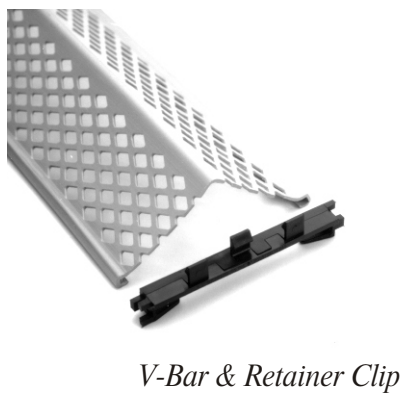
V-Bar & Retainer Clip

C. E. Shepherd Company offers a choice of Splash Fill Slats to fit your needs. Shepherd high quality extruded PVC cooling tower fill slats are designed for both parallel and perpendicular installations, (most common in crossflow cooling tower applications). Rigid and strong, Shepherd Fill Slats are engineered for maximum efficiency with minimum power requirements.